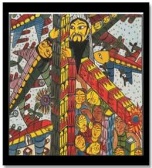
Figure-3 SwarnaChitrakar'sPatachitra on 9/11.

Side by side they begin to represent the patachitra on the theme of 9/11 in USA.