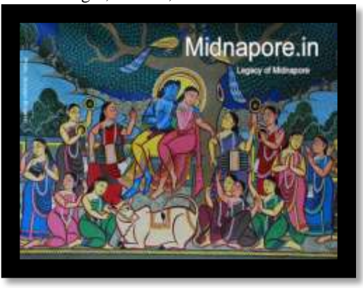
Figure 1 radha-krishna with sakhiespatachitra of Midnapore.

this spectacular art form with songs to express their existence and cultural identity. Patachitraof West Bengal is generally classified in different types like Durga Pot, Tribal Patachitra, MedinipurPatachita and KalighatPatachitra. The themes of their painting is mostly cultural, mythological, religious, folk lore and socio-political. Most significantly, the religious patachitaof West Bengal covers the narratives of Hindu epics like Ramayana and Mahabharata and it also relates the Hindu God and goddesses Radha Krishna, Chaitanya, Kali, Lord Shiba, Most popular of this patachitra is bengali folklore of ManasaMangol, Chandi, Behula and Lakhinder.