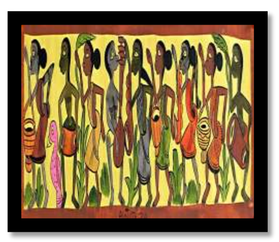
Figure-5 Tribal patachitra Bengal from joy roychoudhury's web log.

The folk traditions and morals of the rural immigrants now clashed with the increasing influence of European life style on the rich residents of the city. Its subtle influence put in place an artistic hierarchy in the minds of educated Bengali with English art at top distracting them from the work of their countrymen. During the post- independent phase, in the transformation of the patachitra, those who felt the fear of losing Indian Culture due to British colonial power would soon use folk art as a tool for elite nationalistic self -determination, setting in the motion of culture of patronage that would support the folk art into 21st century. In post-modern society the t-shirts and umbrellas are printed with the style of patuas artist paintings.