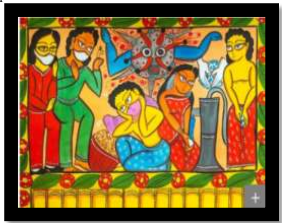
Figure -6It is done by SwarnaChitrakar of PachimMedinipur about Covid19.

jadupatuas from the santal tribe, the largest tribal community in India. Jadu pats generally depicted the tribal origin stories as well as scenes from marriage ceremony to different festivals. Jadu painters lack the vibrant color of other patuas. Yet they are incredibly important to the spiritual life of their community beyond the story tellers. On some festive occasions, they displays the paintings of sundry recurring topics of Ramayana and Mahabharata and even the paintings of the very current issues like 26/11 in Mumbai and Covid-19 pandemics. Etc.